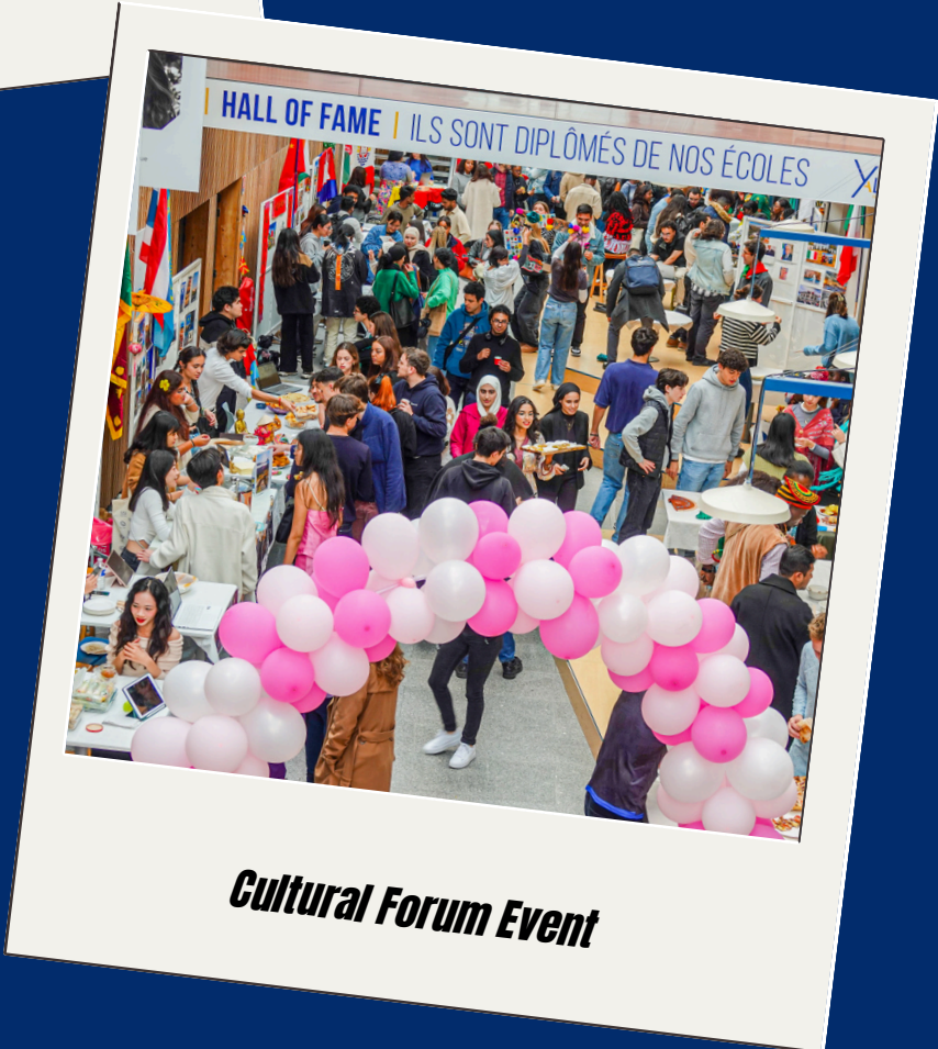
Cultural Forum Event