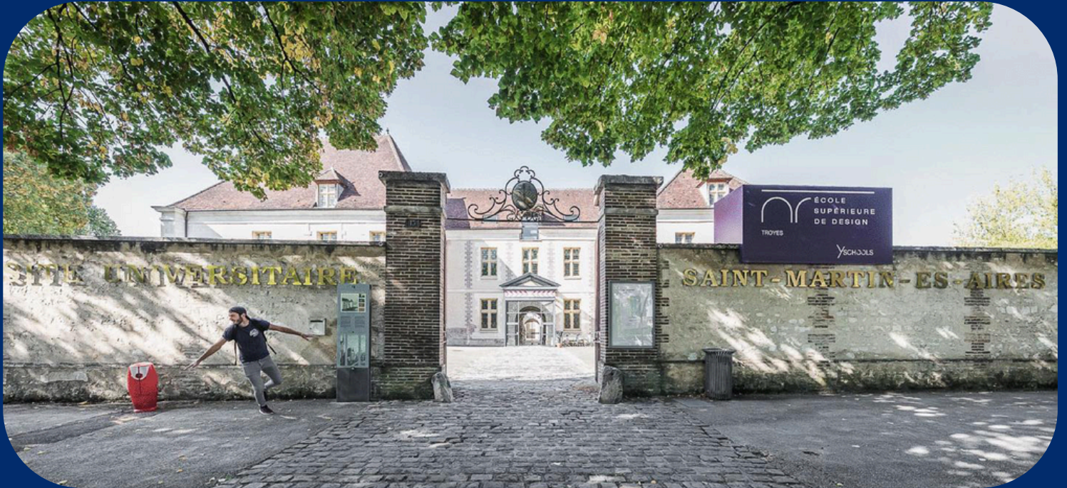
Campus St. Martin Troyes – Design School