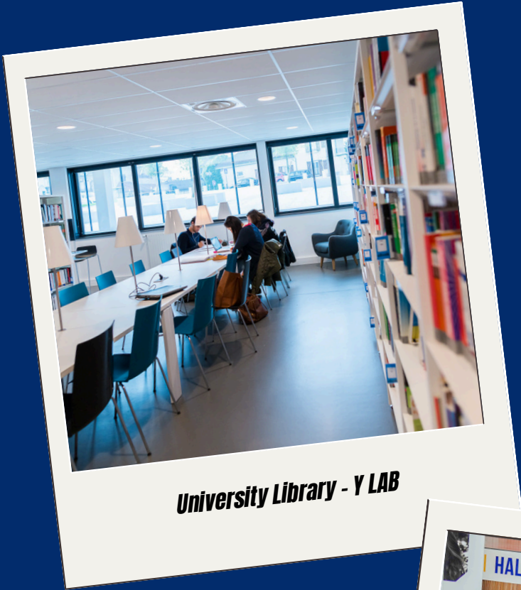
University Library - Y LAB