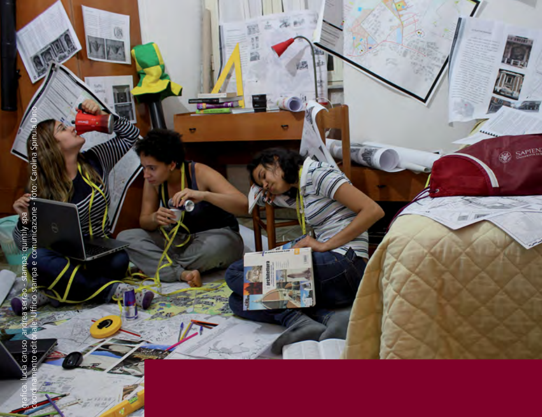
grafica: lucia caruso, andrea serrao - stampa: quintly spa Coordinamento editoiale: Ufficio stampa e comunicazione